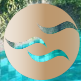
The Waters Water Jet Terrace